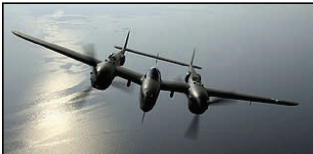
P-38 Lighting in flight over water