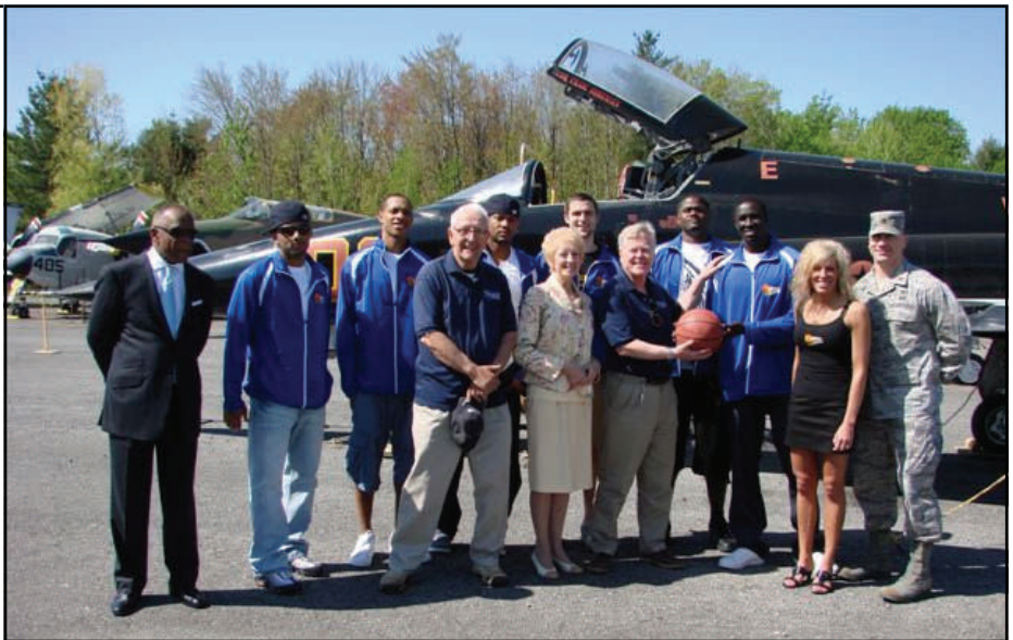
(Top) The Albany Legends players pose with team officials, ESAM personnel and a 109th Air Lift Wing representative in front of ESAM’s F-5.