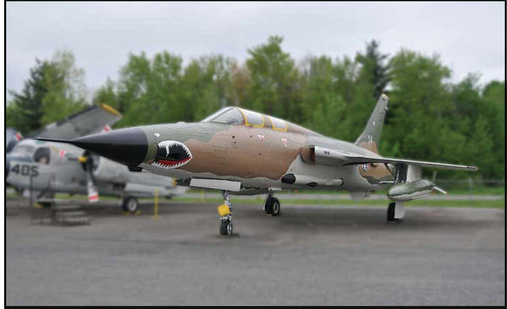
ESAM's F-105 as shown on the ESAM website